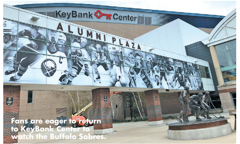
Fans are eager to return to KeyBank Center to watch the Buffalo Sabres.